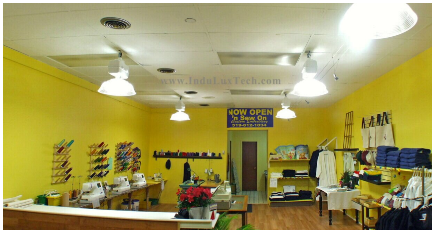
TOP: Retail store before upgrading to Induction Lighting BOTTOM: Magnetic Induction fixtures installed in the retail store